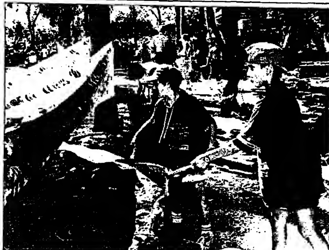
Thousands of families participated in the Jewish National Fund's happening yesterday in the Herzl Forest. The event was part of the celebration of the centennial of the first Zionist Congress.